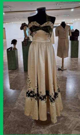
Abdulmedit Efendi Köşkü Museum Istanbul

Thus, families will not have to constantly buy clothes for their children and will contribute to the family economy. Children will be able to wear the outfit worn on special occasions from the age of 5 to 15. It will also reduce consumption and production. We will protect nature and natural resources.