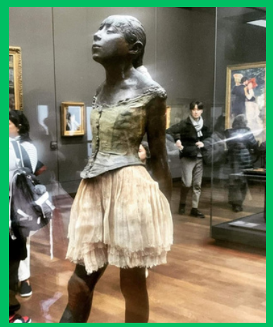
Musee d'ORSAY Paris