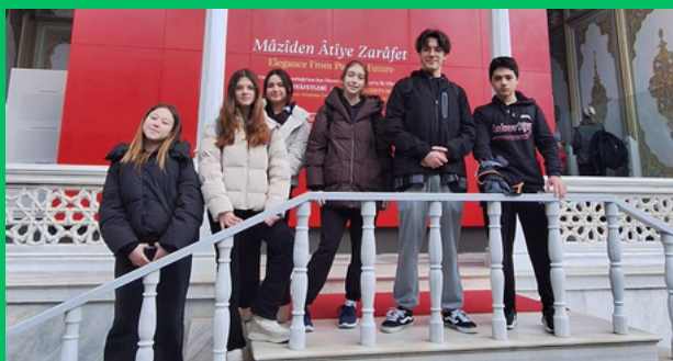
Sadberk Hanım Museum and Abdulmecit Efendi Kökkü Museum